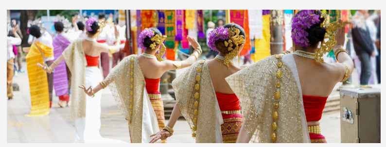
Day 4: Bangkok | A Serene Escape to Koh Kred Island

Upon arrival in Thailand's bustling capital, enjoy leisure time to acclimate and explore the vibrant city on your own. The following day, dive into Bangkok's artistic and historical heritage with visits to two of its most significant landmarks. Start at the Grand Palace, Thailand's most opulent monument, where the Royal Residence and the sacred Wat Phra Kaew house the revered Emerald Buddha. Continue your journey to the canal-side Jim Thompson House, a museum dedicated to the man who revitalized the Thai silk industry. Meet one of the last artisan families still practicing Thompson's silk-making traditions today.