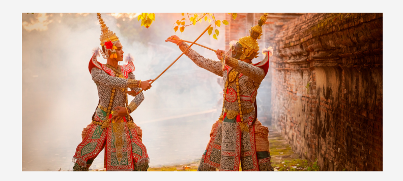
Day 3: Bangkok | Uncover Urban Art and Learn Thai Painting Techniques

Immerse yourself in Thailand's rich artistic legacy, exploring the vibrant cities of Bangkok and Chiang Mai. Engage with master artisans, art historians, and experience hands-on workshops that reveal the beauty of Thai art and craftsmanship.