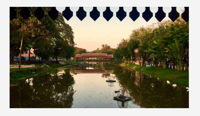
Day 5: Siem Reap | Angkor Wat Tour with Khmer Scholar & Stories from the Pol Pot Era

Explore the magnificent Angkor Wat with a Khmer scholar, who will guide you through the history, culture, and legends behind this UNESCO World Heritage Site. Walk through intricately carved hallways and learn about the significance of its basreliefs. Later, visit lesser-known temples before meeting a family who survived the Khmer Rouge regime, offering you a personal glimpse into Cambodia's more recent history.